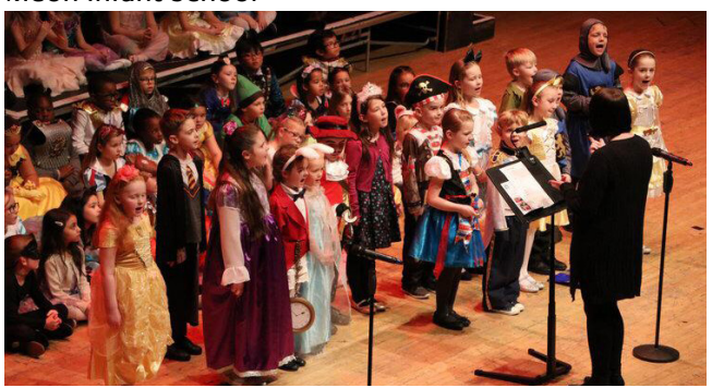
Penhale Infant School