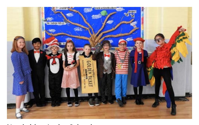
Newbridge Junior School