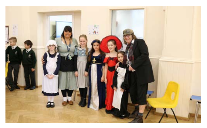
The Gordon Children's Academy