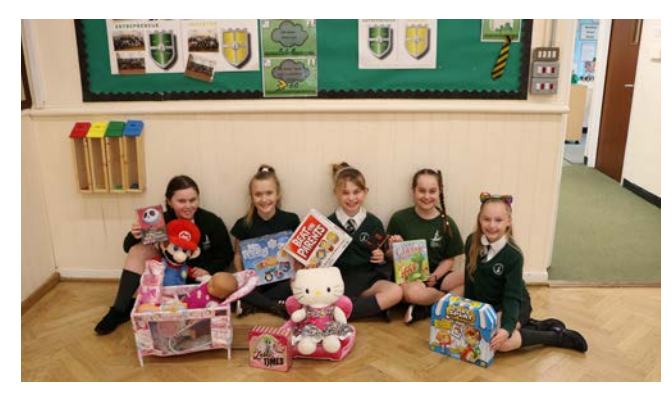
The Gordon Children's Academy