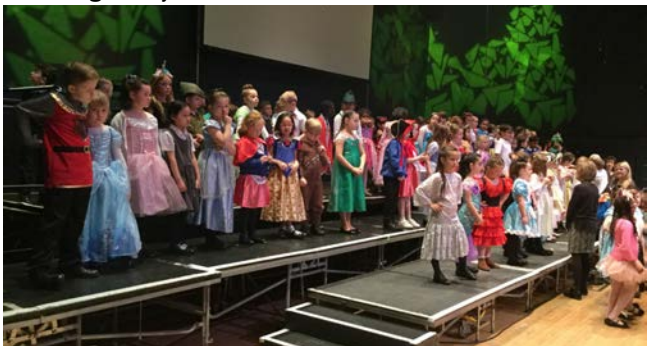
Meredith Infant School