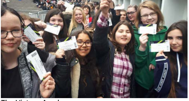
The Victory Academy