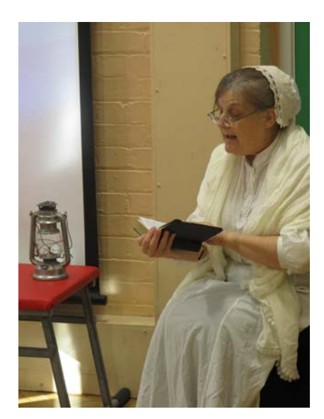
Penhale Infant School