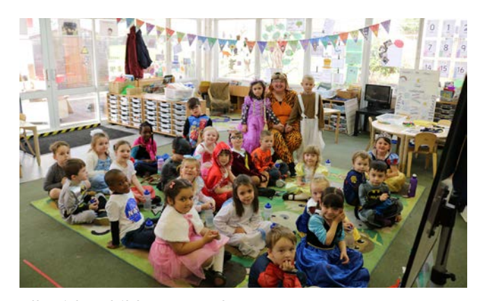
All Faiths Children's Academy