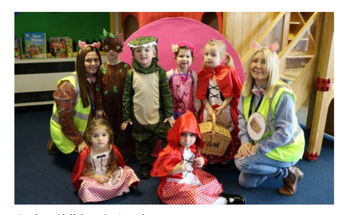
Cedar Children's Academy