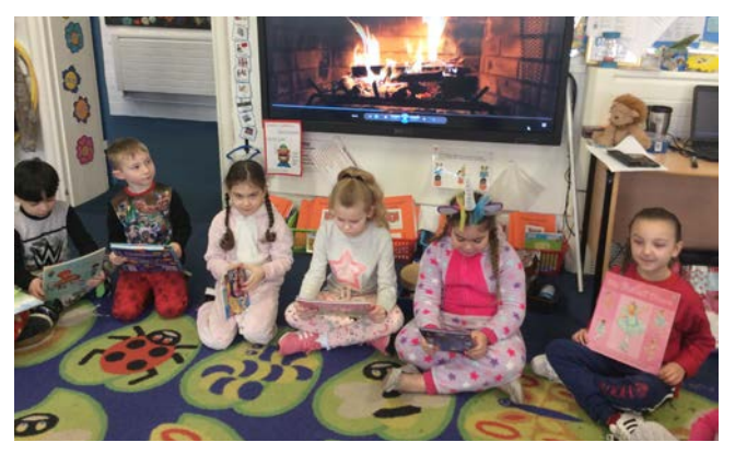
Penhale Infant School