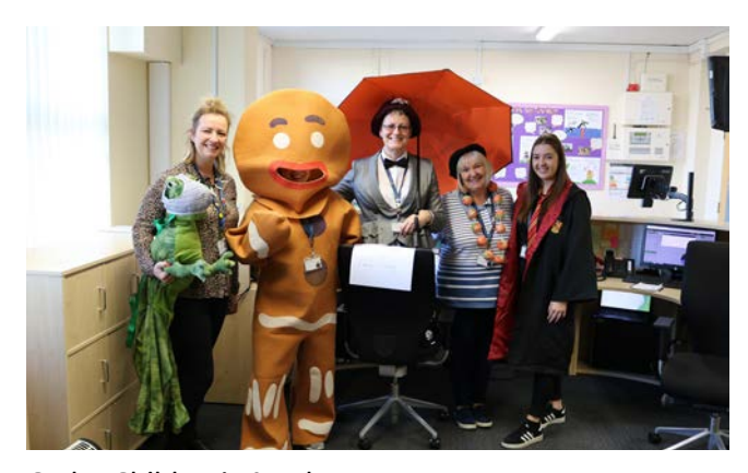
Cedar Children's Academy