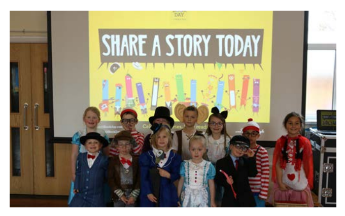
Meon Infant School