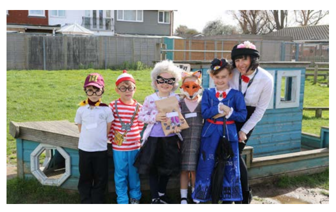
Moorings Way Infant School