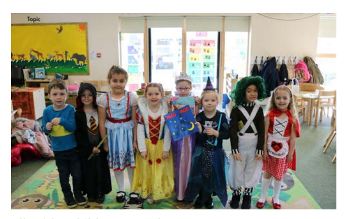
All Faiths Children's Academy