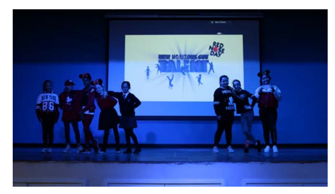
New Horizons Children's Academy