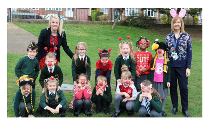
The Gordon Children's Academy